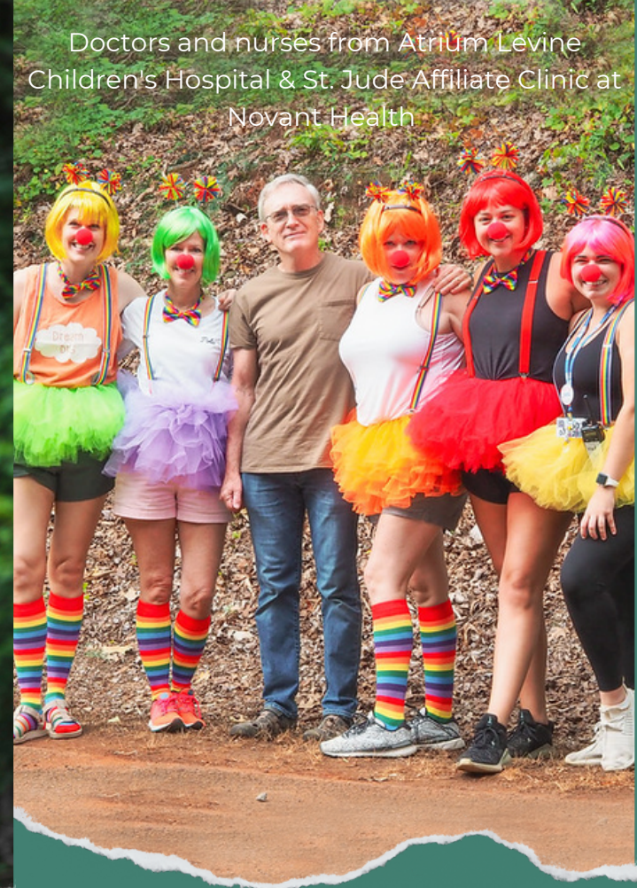
Doctors and nurses from Atrium Levine Children's Hospital & St. Jude Affiliate Clinic at Novant Health

We provide a traditional summer camp experience with a variety of planned activities designed to promote self-confidence, independence, building friendships and of course fun!