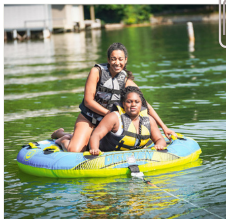
Best Summer Ever